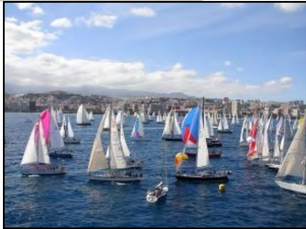
Over 200 yachts from all over the world are competing in the world's largest transocean sailing event .

This annual transatlantic rally starting each November in Las Palmas de Gran Canaria, has now become the most popular way to cross the Atlantic. The largest transocean sailing event in the world, every year the ARC brings together over 200 yachts from all over the world. The Caribbean destination is Rodney Bay in Saint Lucia, one of the most beautiful islands in the Lesser Antilles. The 2700 nautical mile passage on the NE trade wind route takes on average between 14 and 21 days. The "STADIUM" will be equipped with an INFINITY enhanced SAILOR FB250 terminal. Two ISAT phones will also be available onboard mostly for voice communication and for emergency purposes. Taking into account the GMDSS requirements of such an ocean going yacht, an additional SAILOR Mini-C has also been installed. In terms of airtime a 5GB/month allowance coupled with INFINITY will take care of all the data requirements of the 6 member crew, including web browsing, email, weather reports as well as transmission of race photographs and videos. It is expected that, with compression and bandwidth management, the 5GB allowance will be increased to an equivalent of 15GB/month which is more than enough for