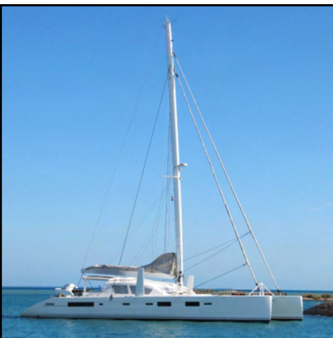
The 70ft catamaran "Stadium" which is equipped with an INFINITY enhanced SAILOR FB250 terminal.

my personal use of our best selling products and services in a hands-on, real-life situation and the challenge of using such equipment properly and efficiently to increase our performance".